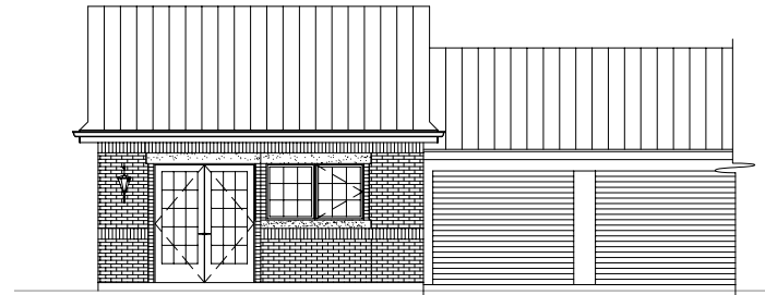
PARTIAL SOUTH ELEVATION SCALE: 1/4"=1'-0"