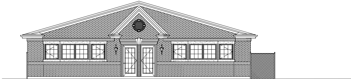
PARTIAL WEST ELEVATION SCALE: 1/4"=1'-0"